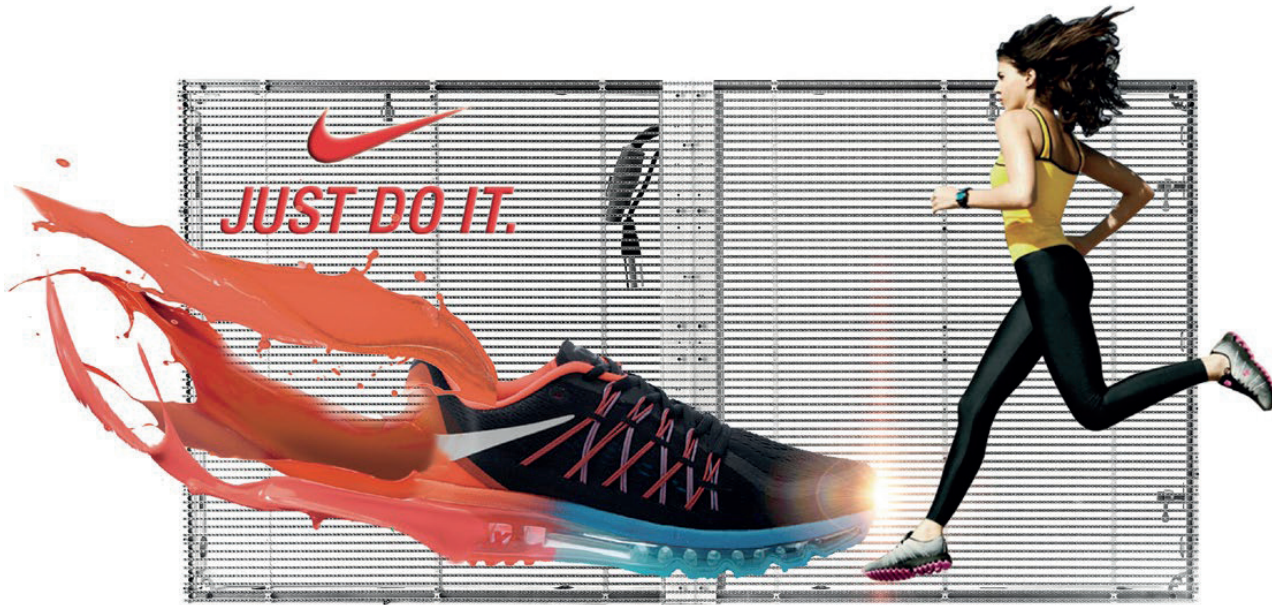
Wide viewing angle SMD